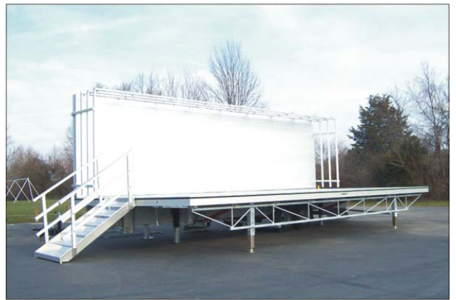
(Available only on Models 24', 28', 32', 40')

For some events you may want to use this stage configuration - a 15ft deep stage with an 8ft high backdrop from which you can hang banners. Just remove the guardrails.